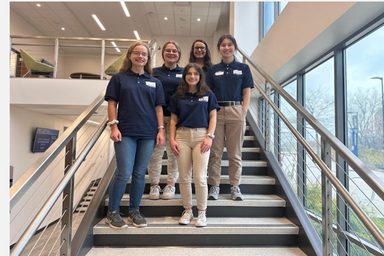
University of Akron