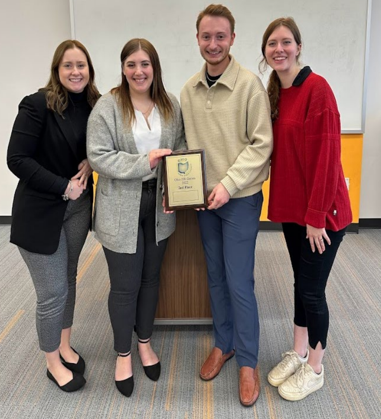
Youngstown State University