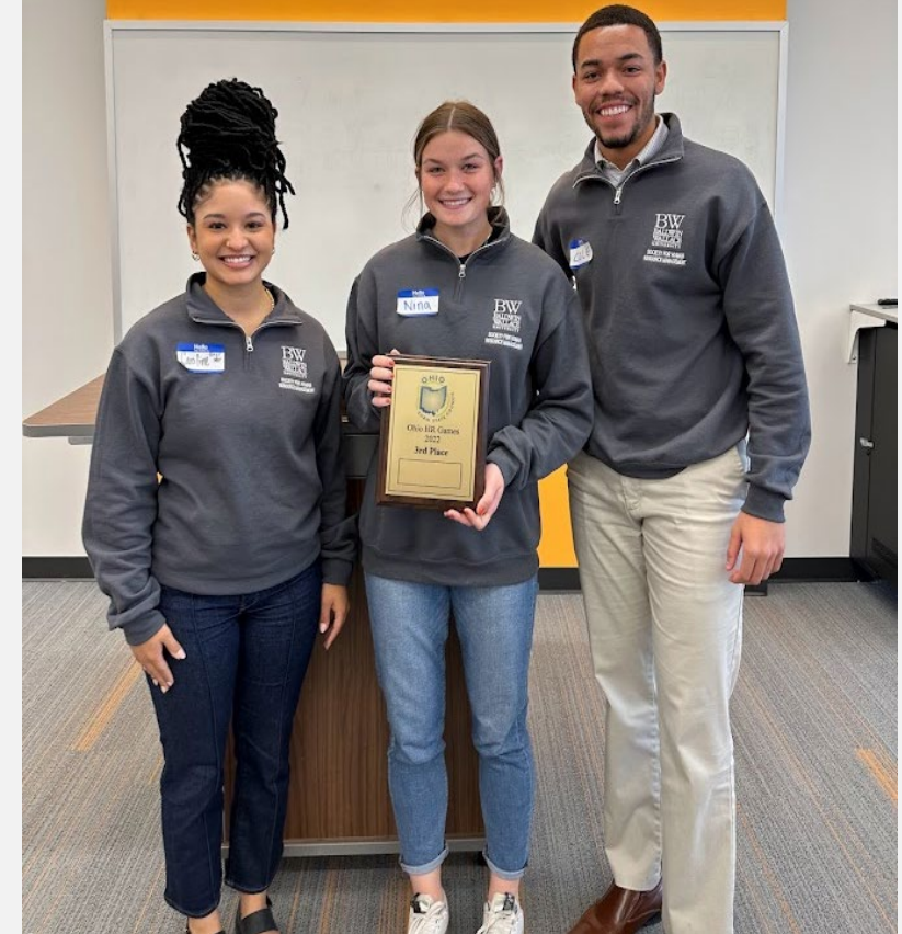
Baldwin Wallace University