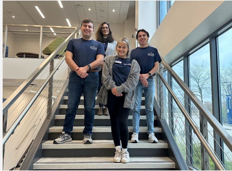
John Carroll University