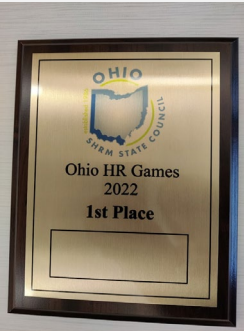
1 st Place