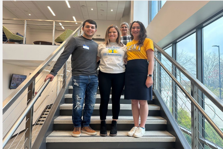
Kent State University