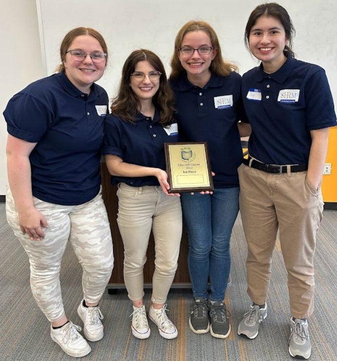
University of Akron