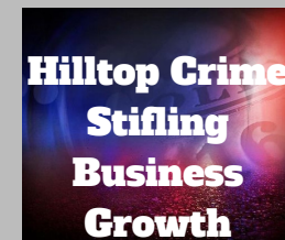
Hilltop Crime Stifling Business Growth