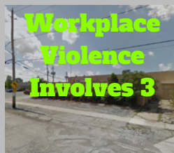
Workplace Violence Involves 3