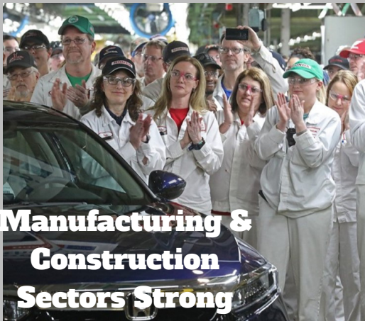
Manufacturing & Construction Sectors Strong