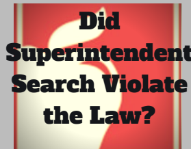
Did Superintendent Search Violate the Law?