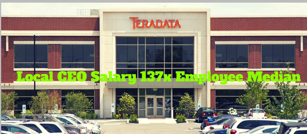
Local CEO Salary 137x Employee Median