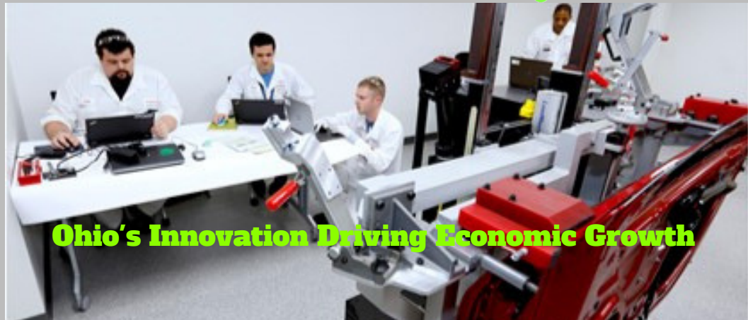
Ohio's Innovation Driving Economic Growth