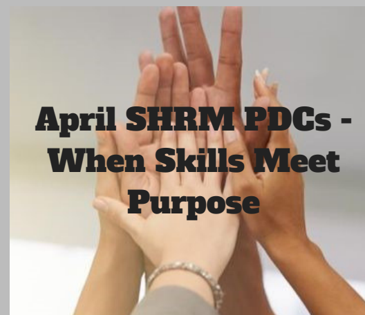
April SHRM PDCs - When Skills Meet Purpose

HR professionals do everything! Recruiting to reviewing, counseling to caring, developing to discharging, finance to fun, we drive employee experience.