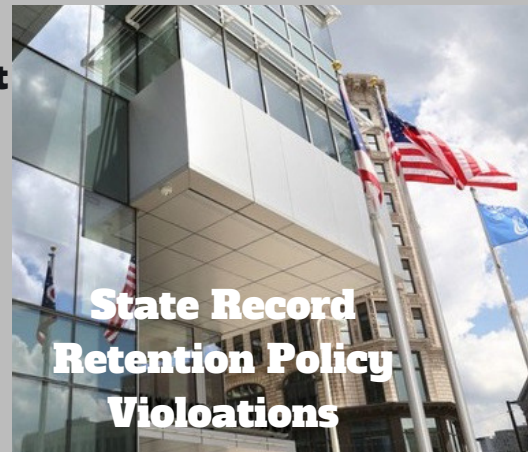
State Record Retention Policy Violations